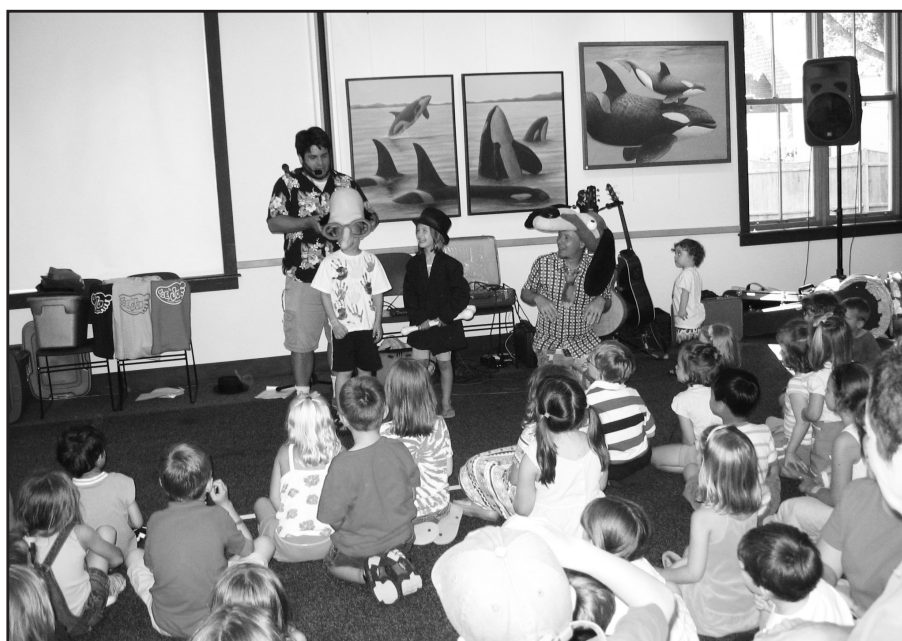
Toe Jam Puppet Band

Saturday, December 8 – 10 am - Visit from Santa and Holiday Sing-a-Long