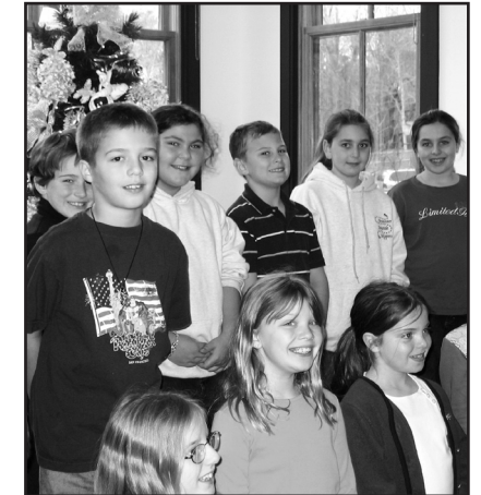
Eddy School 4th Graders